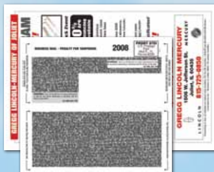
8.5" x 11" glue/perf Self-Mailer