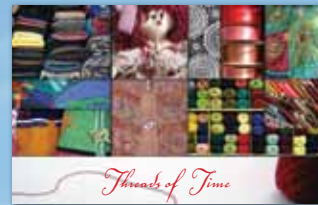
4" x 6" 4/4 Postcard