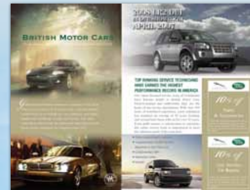
8.5" x 11" half-fold Self-Mailer