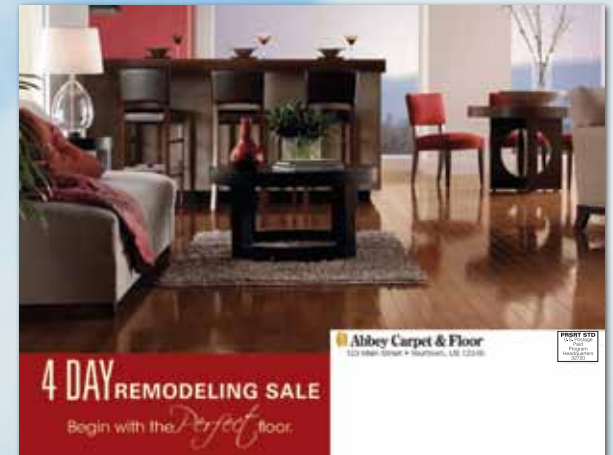
Oversized 8.5" x 11" 4/4 Postcard