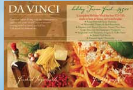
6" x 9" 4/4 Postcard